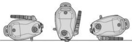
Three directions horizontal storage