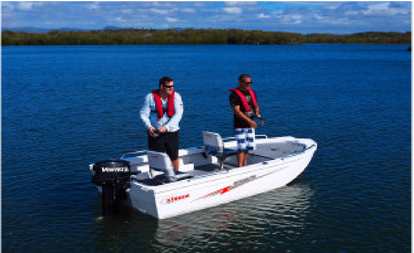
Stacer 429 Rampage 2019