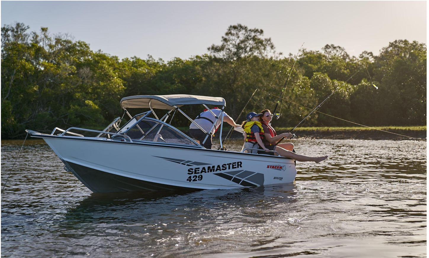
Stacer 429 Seamaster 2024 NEW MODEL