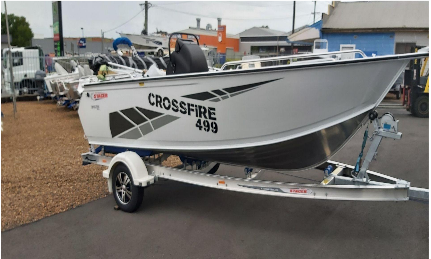
Stacer 499 Crossfire SC 2023 Fisher Casting Platform