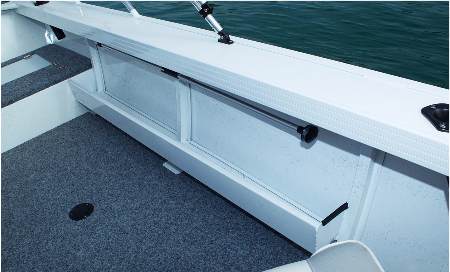
Stacer 529 Outlaw Side Console 2024 Revolution Hull