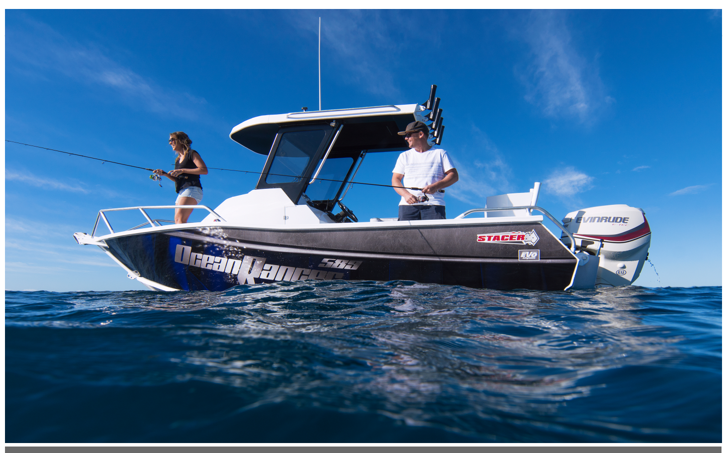
Stacer 589 Ocean Ranger Centre Cab 2024