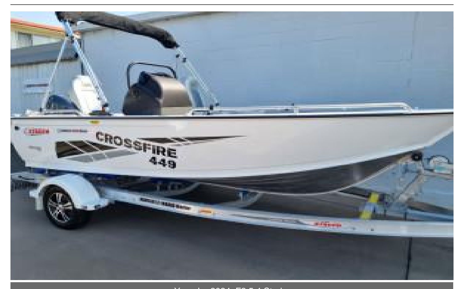
Yamaha 2024 F2.5 4 Stroke

400-404 Pacific Highway Belmont NSW 2280