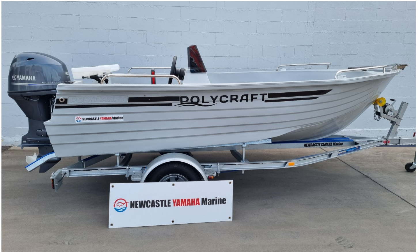
450 Drifter side console