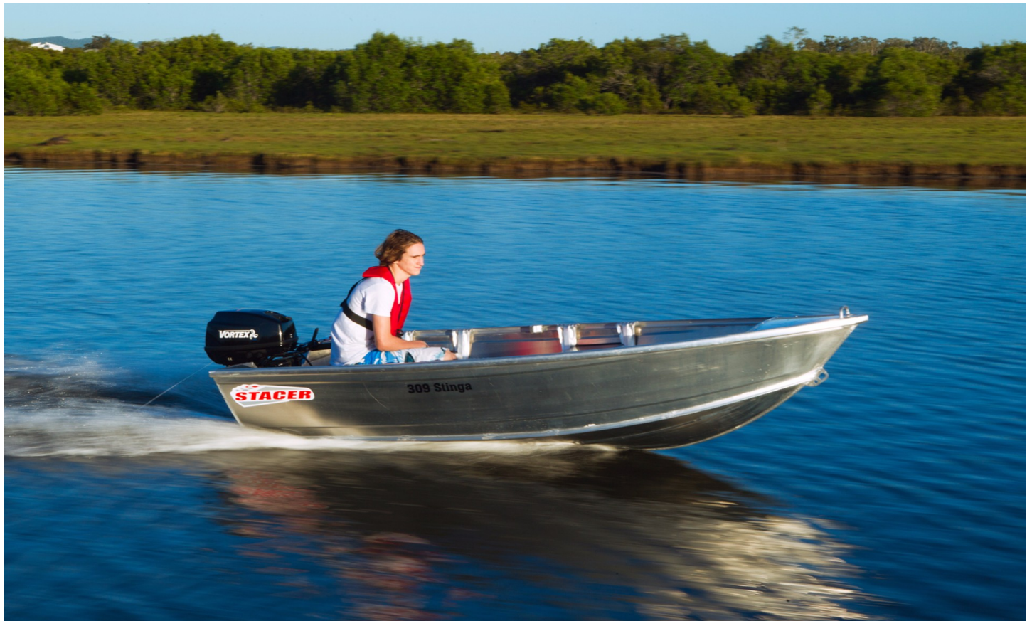
Stacer 309 Stinga 2021